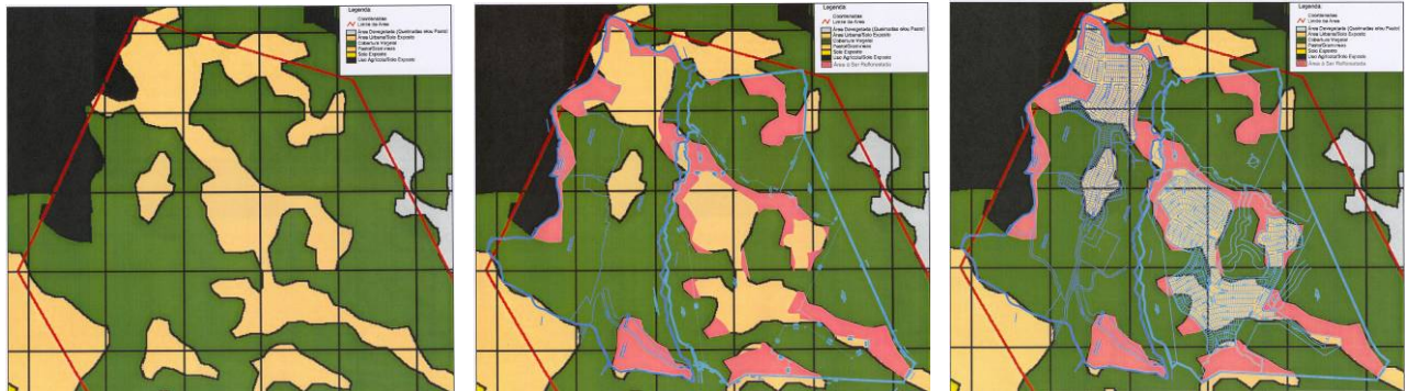
Figure 3 – Analysis of Genesis I and II over interpretation of Terradatum image from Landsat 5

When planning the Genesis Project, comprehensive analyses were carried out to prevent negative environmental impacts cited above (3.3) and to restore natural environment characteristics of the original Atlantic rainforest in the region.